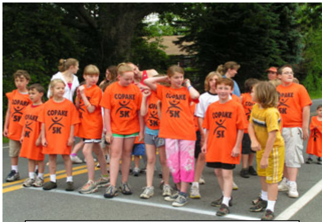
And almost lined up for the 1K.