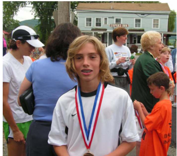
Didn't he win last year, and the year before, and the year before that and the first year?