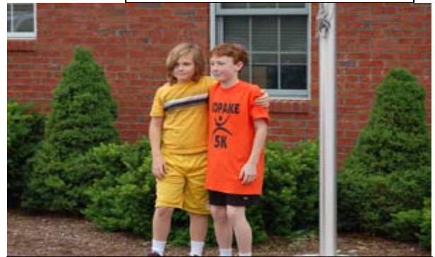
Promised to be friends after the race.