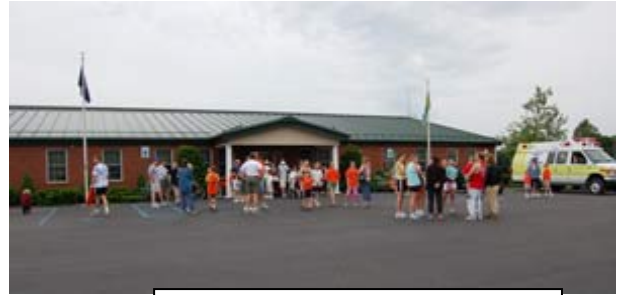
And told tall tales.