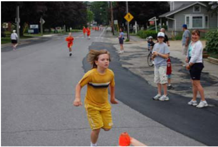
And we ran.