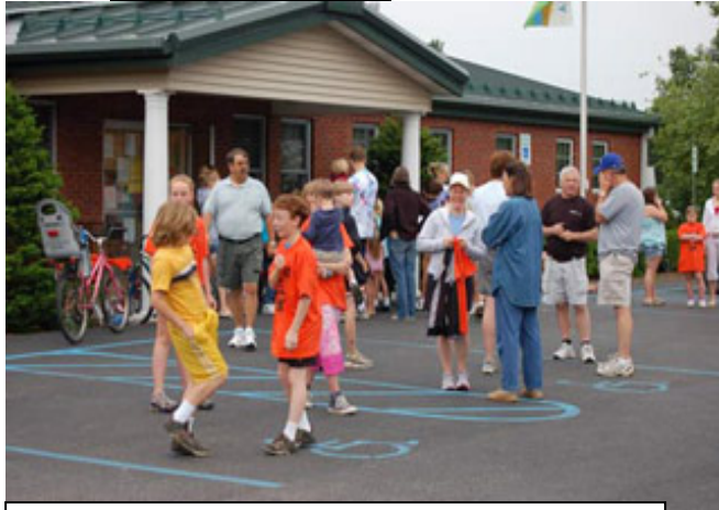
We gathered and registered.