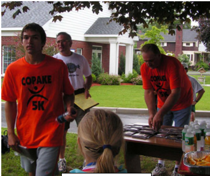
They had winners.