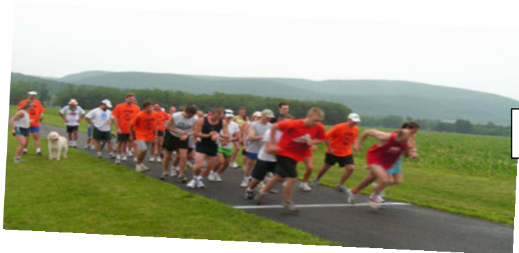
And the older crowd is off for 5K.