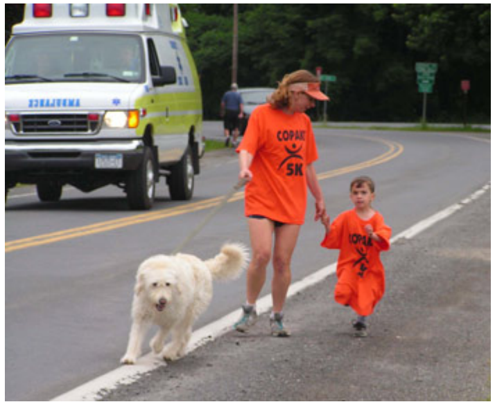
And we ran....everybody did.