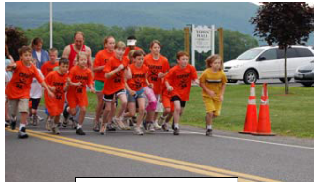
Then we're off.